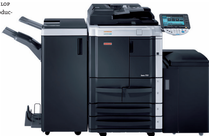
ineo 751 with booklet finisher FS-610, and the large capacity tray LU-405