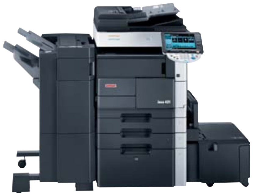
ineo 421 with staple finisher FS-523, large paper cassette PC-407 and the large capacity unit LU-203

use, especially thanks to the operating panel's large, full-colour screen. In the monotonous world of monochrome office machines these distinguishing features make a big difference.