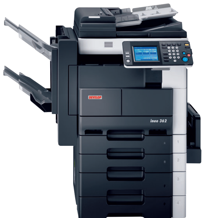
ineo 362 with embedded finisher (FS-530), paper cassette (PC-206) and document feeder (DF-620)

The ineo 362 not only prints and copies to professional standards, it also offers a wide range of useful scanning functions such as scan to e-mail, which allows scanned documents to be sent direct to a recipient's e-mail address. Users can also scan to and print in and out of an optional password-protected box, which gives every user individual storage space on the system's hard disk. Documents, for example, can be stored in that box ready for reprinting – a convenient feature that means there is no need to reopen the document on a PC.